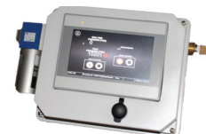
Pressure Data Logger